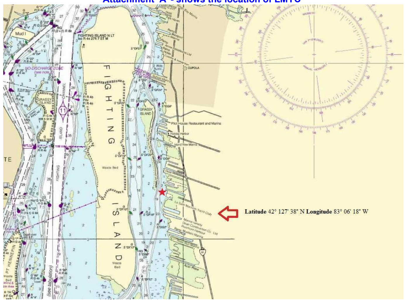
Attachment 'A' - shows the location of LMYC